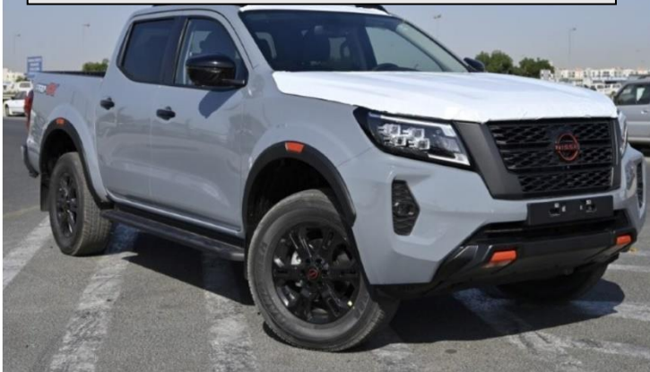
EXTERIOR / INTERIOR: TECHNO GRAY / BLACK