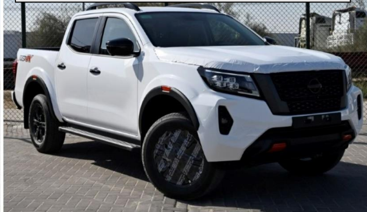
EXTERIOR / INTERIOR: WHITE / BLACK